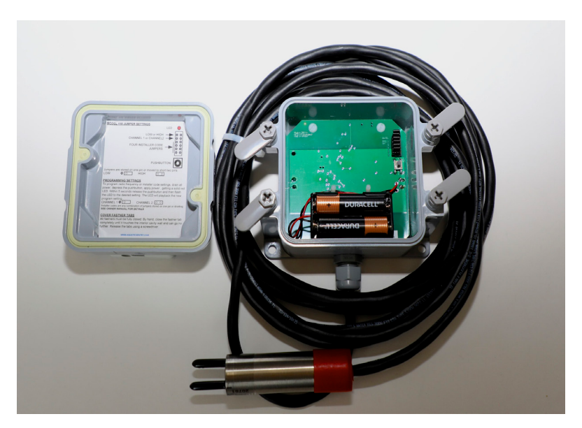
FIG 4 Outdoor Transmitter Batteries Installed