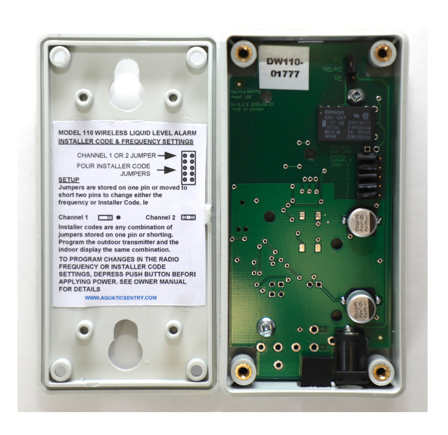
FIG 1 Indoor Alarm Display Interior