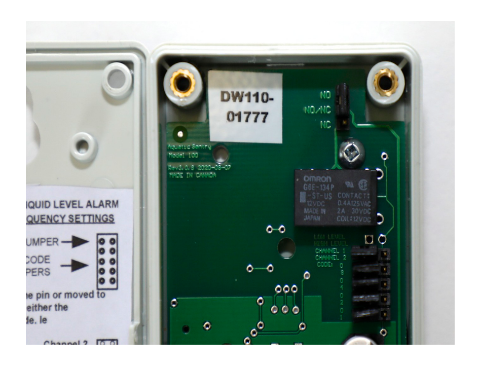
FIG 6 Indoor Alarm Display Setting relay to Normally Open or Normally Closed