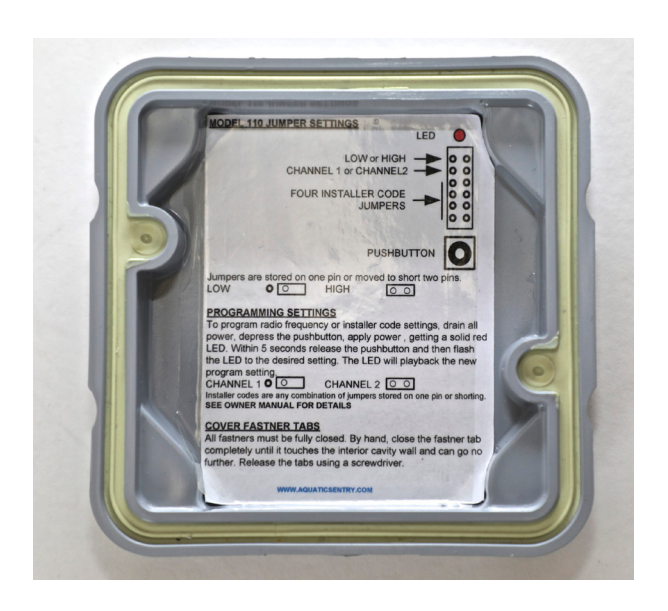
FIG 2 Outdoor Transmitter Enclosure Cover Interior