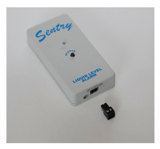
FIG 5 Optional Relay Output