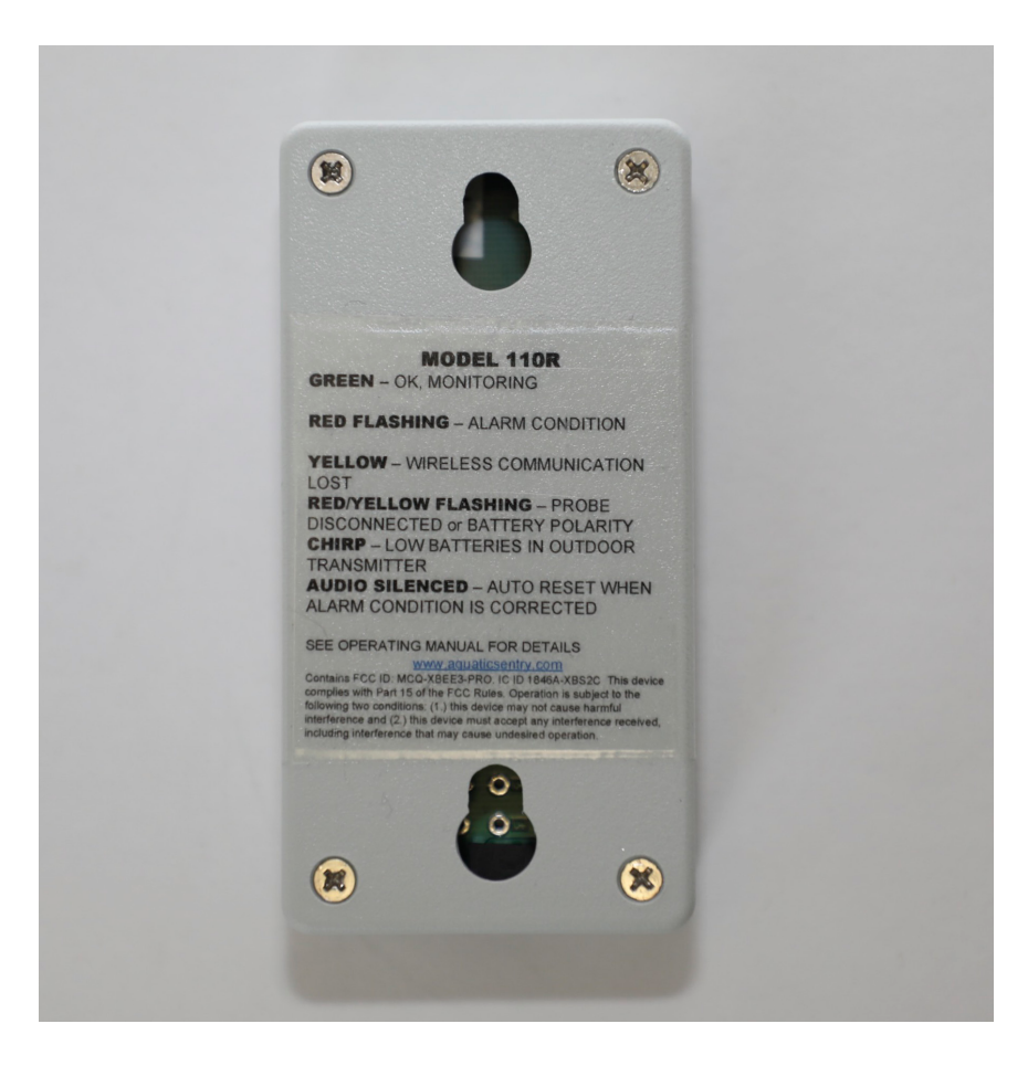
FIG 7 Idoor Alarm Display Rear Cover Operating Instructions